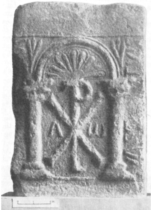
Chi-Rho symbol, formed from the first two letters from the word 'Christ' in the Greek language, 4th century Spanish tombstone

(CCC 102, 105-106, 109-111, 120, 128-129)