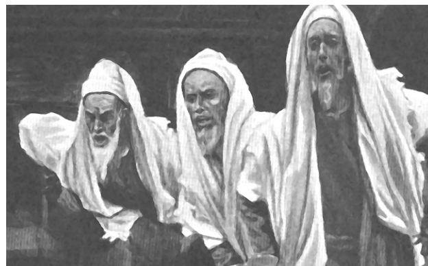
The Pharisees accusing Jesus, by James Tissot, 1856-1902

“The seven deadly sins are perverse inclinations that cloud our consciences and distract our judgment of what is good and what is evil.”