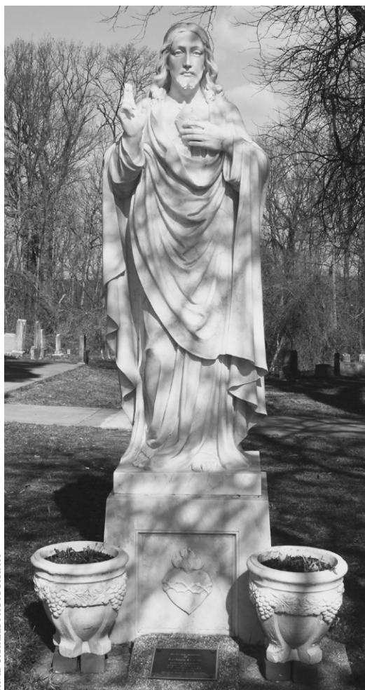
The Sacred Heart of Jesus, full of endless mercy

“The Lord’s desire to save us is so strong that it extends even past the grave.”