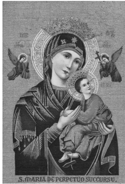
Icon of Our Lady of Perpetual Help

Though the error of Luther is over 500 years old and that of Pelagius 1500 years old, people today still fall into them. Present-day rationalists essentially have picked up the Pelagian error that we do not need God's grace but can reach perfection through our own means. Luther's doctrine of the irreformable corruption of human nature was picked up by a Catholic bishop in France named Cornelius Jansenius. Although Jansenius died in communion with