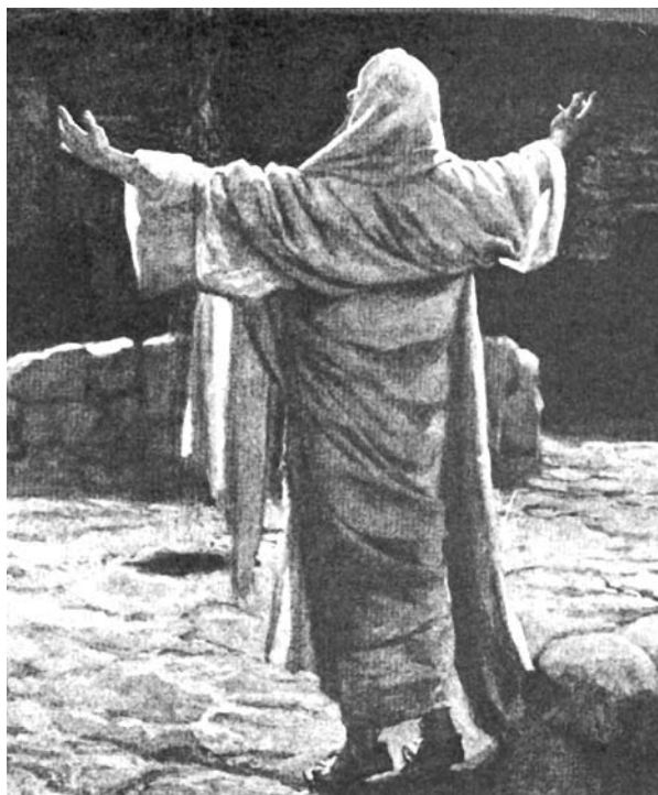
Christ going to the Mount of Olives at night, by James Tissot, 1856-1902

tends to deny that there is such a thing as real right and wrong. It tends to equate whatever one likes with being right and good, and whatever one doesn't like with being wrong and bad. How on earth did we get such an idea of human freedom? To answer this question, we must turn to consider what kind of morality lies behind this understanding of human freedom.