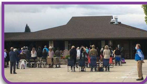
Parishioners of Holy Family Church in Yakima braved the cold for their first outdoor Mass, as reopening began.

Although attendance ranged from about 98 to 70 to 35 people attending the first weekend's Masses, out of a maximum capacity of 100 people, those who came