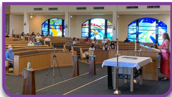
Parishioners at Our Lady of Fatima Church in Moses Lake practiced social distancing at a recent Mass.