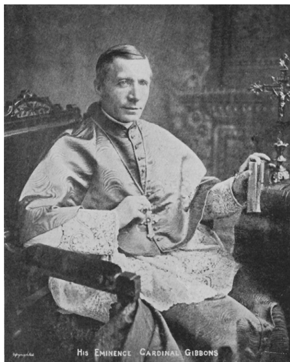
His Eminence James Cardinal Gibbons, Archbishop of Baltimore from 1877 to 1921