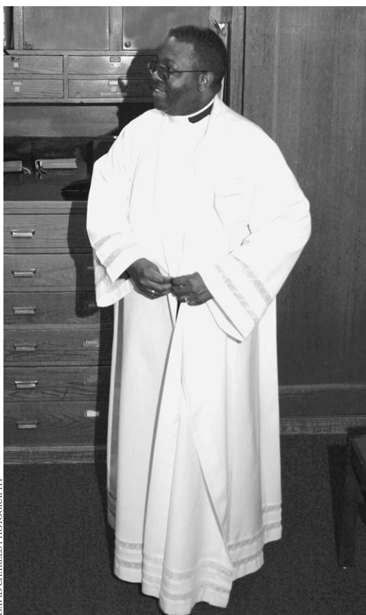
A Catholic deacon vesting for Mass in the sacristy of a parish

“Parishes are geographic areas with a common building for worship usually called a church.”