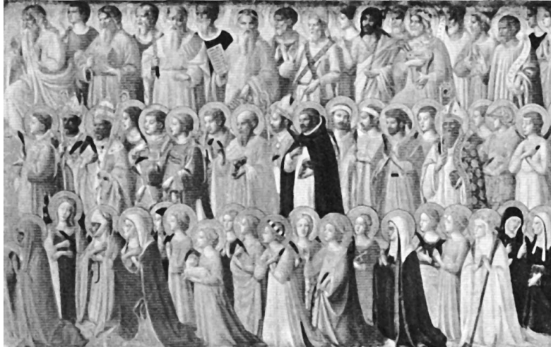
Saints from Predella, detail of the Madonna of Sandomenico, by Fra Angelico, 1387-1455

And Mary said, "My soul magnifies the Lord, and my spirit rejoices in God my Savior; for he has regarded the low estate of his handmaiden. For behold, henceforth all generations will call me blessed; for he who is mighty has done great things for me, and holy is his name. And his mercy is on those who fear him from generation to generation. He has shown strength with his arm, he has scattered the proud in the imagination of their hearts, he has put down the mighty from their thrones, and exalted those of low degree; he has filled the hungry with good things, and the rich