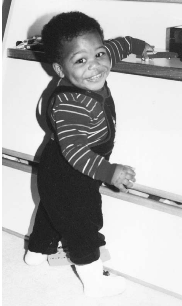
A child is always a blessing

artificial interference with conception is acceptable because, so it is supposed, human beings are mere biological beings. Yet Sacred Scripture teaches us that our bodies, like our souls, are holy to God: “Shun immorality. Every other sin which a man commits is outside the body; but the immoral man sins against his own body. Do you not know that your body is a temple of the Holy Spirit within you, which you have from God? You are not your own; you were bought with a price. So glorify God in your body” (1 Cor 6:18-20).