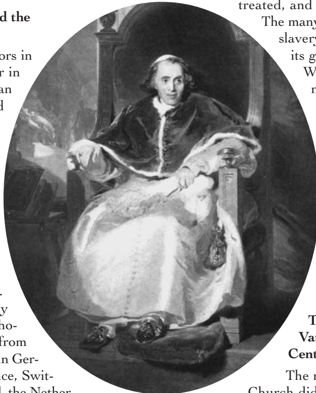
Pope Pius VII, a Benedictine monk, reigned from 1800 to 1825, began to reestablish the Jesuit Order, resisted and excommunicated Napoleon, and was himself imprisoned by the French ruler, established several important feast days in honor of Mary, and aggressively sought to foster evangelization; portrait by Sir Thomas Lawrence, 1769-1850

religion and science, faith and reason were viewed as incompatible opposites. The consequences for the faithful were dire. Not only did outright persecutions result from the denial of God’s role in human affairs, such as that which characterized the French Revolution in the late 1800s, but more importantly the faith of many people was systematically undermined, so that today, throughout nearly all of old Christendom and the parts of the world where