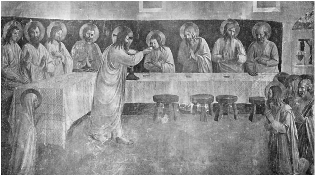
The Institution of the Eucharist, by Fra Angelico, 1387-1455

larger persecution of the entire Christian community in Jerusalem led by the Pharisee Saul, who would later convert and become Paul, the Apostle to the Gentiles (see Acts 9:1-19; Acts 16:9-10). (The Gentiles were those not of Jewish descent.) As a result of this persecution, Jewish Christians fled to other major cities in the empire such as Rome, Alexandria, and Antioch. As Christians spread to these places, they came into more frequent contact with Gentiles, who quickly converted. Gentiles entered the Church in such large numbers that they soon outnumbered the Jewish Christians, and tensions between the two groups began to arise. A major dispute soon arose about whether these new Gentile Christians had to follow all the precepts of the Law of Moses. It was clear that the Ten Commandments (the Decalogue) should be kept by all, but not clear about dietary laws and practices such as circumcision. These latter precepts for centuries had helped to distinguish Israel from its pagan neighbors amidst persecution and slavery. To re-