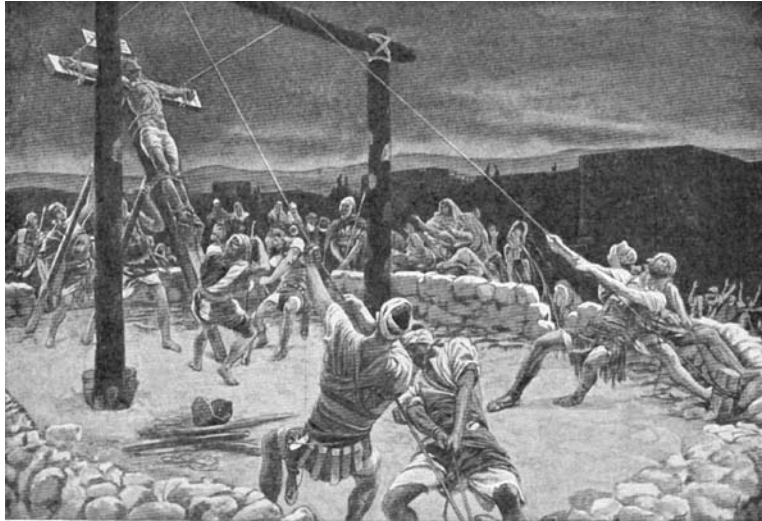
The elevation of the Cross, by James Tissot, 1856-1902

The Church continued to grow and spread in the following few decades during a period of relative peace. This changed when a fire that devastated much of Rome in 64 AD was blamed on the Christians by the emperor Nero. As punishment, Nero began persecuting Christians. Many Christians were martyred during this persecution, including the two great pillars of the Church, Saints Peter and Paul. This persecution lasted only a year, but it began a general attitude of hostility on the part of Roman authorities toward Christians that continued into the 4 th century. During these centuries, the simmering Roman hostility several times erupted into outright persecution in which Christians were killed for their faith. It reached a peak in the early years of the 4 th century when, in the years 303 and 304, the emperor of the eastern half of the empire, Diocletian, issued three edicts initiating a violent persecution that lasted almost twenty years in some regions of the empire. In the West, the emperor Constantine was more favorable towards the Church due to the influence of his mother, Helena, who had become a Christian. Following a miraculous vision urging Constantine to fight under the sign of the cross, Constantine achieved victory over his imperial rivals. He and his eastern counterpart issued the Edict of Milan in 313, which legalized