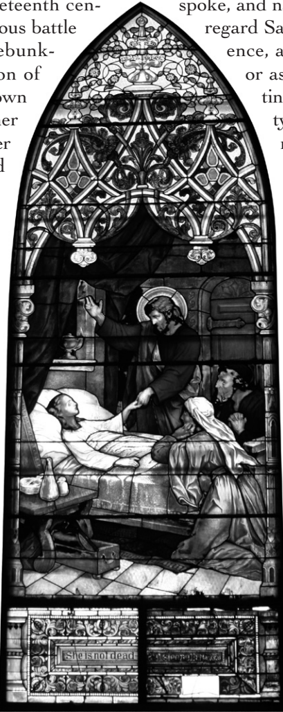
Jesus raising Jairus' daughter

“The story of creation was not intended as a scientific description of events no one could possibly have witnessed.”