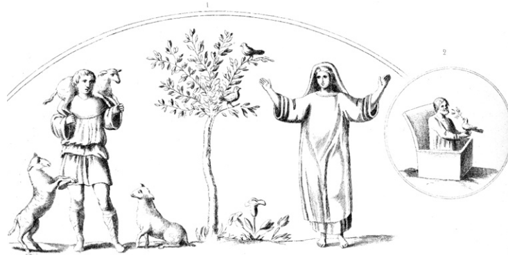
The Good Shepherd, the Blessed Virgin Mary, and Noah with a dove symbolically represented, 3rd century frescoes in the catacombs near Rome

The story of creation in the book of Genesis is